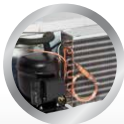
zamenljiva hladilna enota removable compact refrigerating unit